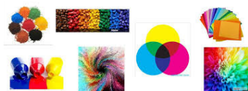
Fig.2 Dyeing and Printing of Textile

ble substituents (auxochromes) to modify its substantivity and tinctorial capacity to overcome inherent limitations of natural dyes. The synthesized dyes will be applied on polyester, cotton, polyester/cotton blend to yield level dyeing, good build-up, complete colour gamut.