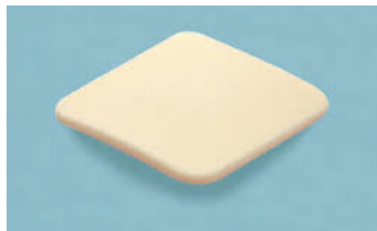
Fig.3 Blood clotting material and Scaffolds

in economical way comparable to the other materials available in commercial market without leading to any side effects such as skin irritations, damage the healthy skin etc.